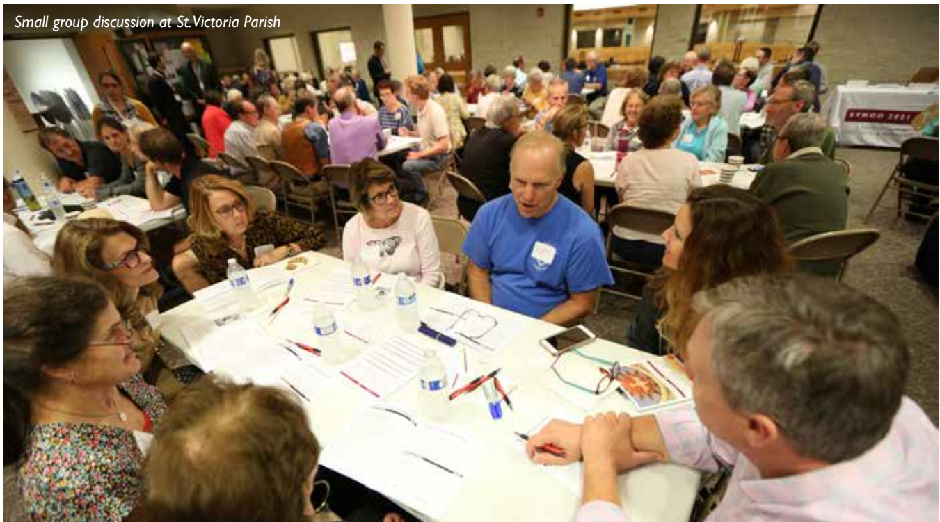
Small group discussion at St. Victoria Parish

Throughout our Synod process, I was delighted to witness a more subtle “washing of the feet” reflected in small group conversations that were respectful and affirming. While we did not always agree with one another, we did listen and strive to respect the dignity of the other. We received the other as other. Time and again I have heard the testimony of those who felt an exceptional unity in our Synod events: a unity born in prayer and in small groups that culminated in the beautiful liturgies of the Synod Assembly. It is my hope that this “washing of the feet” experience continues in our parishes.