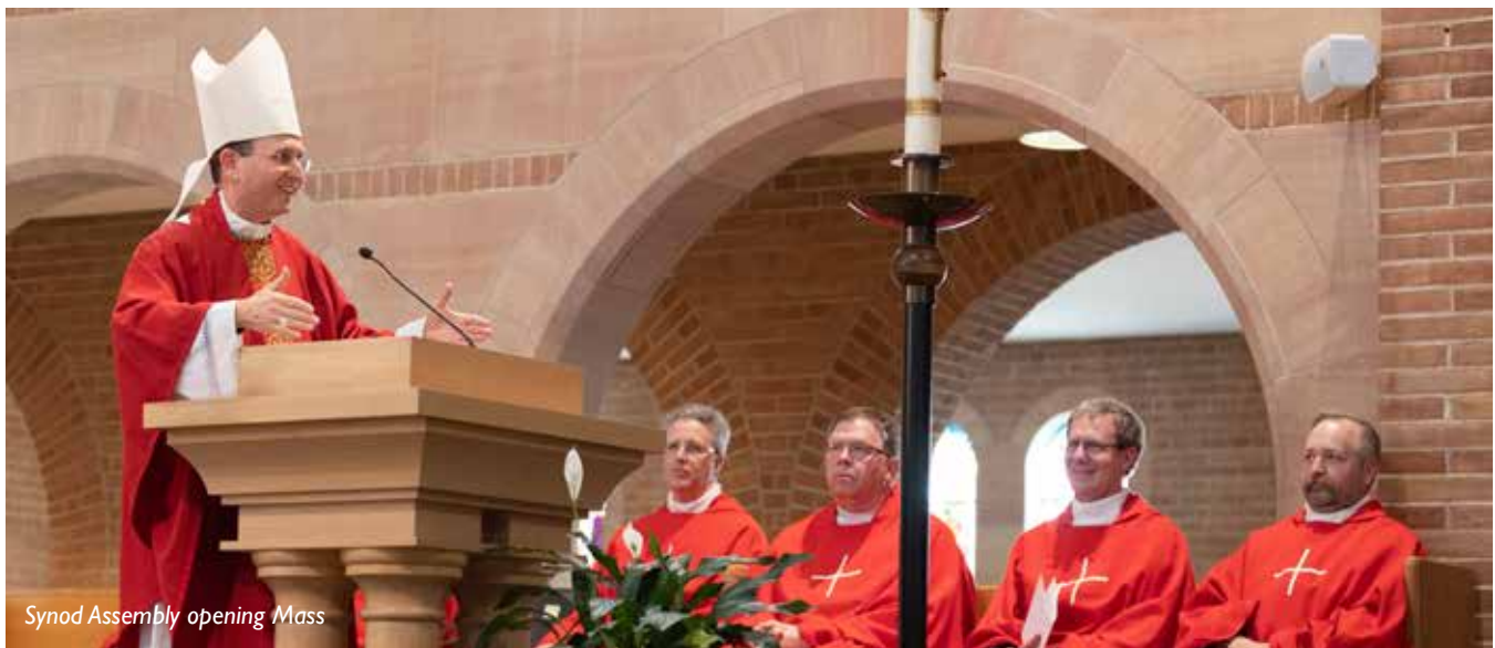
Synod Assembly opening Mass

I would like to share a few words of encouragement in particular to our pastors and to their collaborators on parish staffs: let the fire of the Spirit transform the ordinary pastoral work of your parishes! You do not have to do this alone. Your parish Synod Evangelization Team will certainly be with you. Moreover, through the Office of Synod Evangelization and its valued partners (e.g., the Archbishop Flynn Catechetical Institute), you will have opportunities for Schools of Discipleship, of Charisms and of Evangelization. These resources will help your ordinary pastoral ministry to be more animated by the fire of the Spirit.