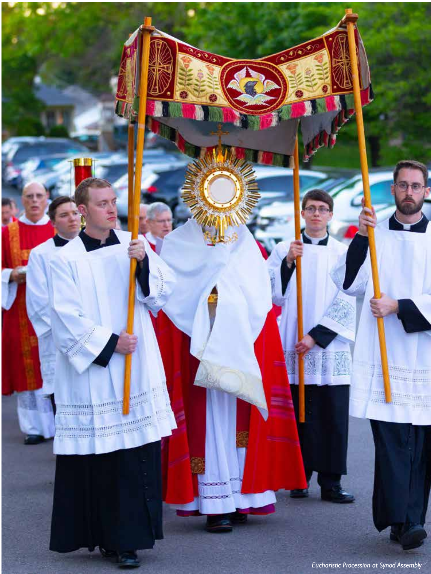
Eucharistic Procession at Synod Assembly