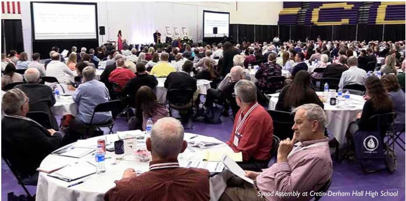
Synod Assembly at Cretin-Derham Hall High School

But with so much data, how can we begin to make sense of it all?