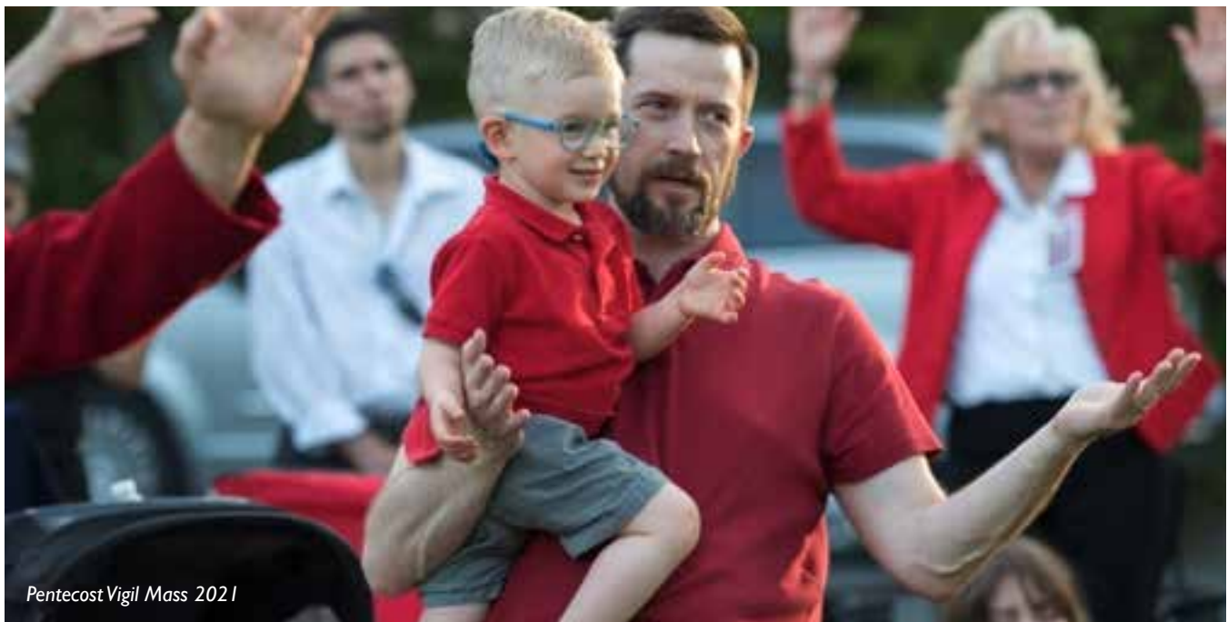
Pentecost Vigil Mass 2021

When the time for Pentecost was fulfilled, they were all in one place together. And suddenly there came from the sky a noise like a strong driving wind, and it filled the entire house in which they were. Then there appeared to them tongues as of fire, which parted and came to rest on each one of them. And they were all filled with the holy Spirit and began to speak in different tongues, as the Spirit enabled them to proclaim. Now there were devout Jews from every nation under heaven staying in Jerusalem. At this sound, they gathered in a large crowd, but they were confused because each one heard them speaking in his own language. They were astounded, and in amazement they asked, "Are not all these people who are speaking Galileans? Then how does each of us hear them in his own native language? We are Parthians, Medes, and Elamites, inhabitants of Mesopotamia, Judea and Cappadocia, Pontus and Asia, Phrygia and Pamphylia, Egypt and the districts of Libya near Cyrene, as well as travelers from Rome, both Jews and converts to Judaism, Cretans and Arabs, yet we hear them speaking in our own tongues of the mighty acts of God" (Acts 2:1-11).