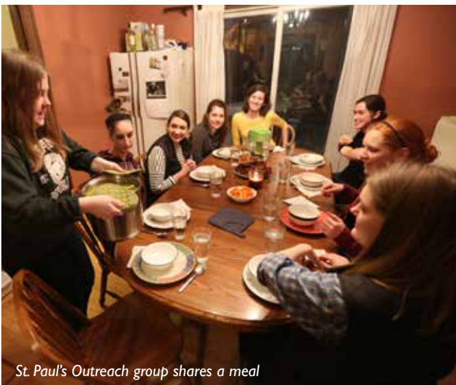
St. Paul's Outreach group shares a meal

I was edified that the Synod Members appreciated the importance of hospitality. In fact, Synod Proposition 1 (Welcome and Hospitality) received the sixth highest vote total at the Synod Assembly.