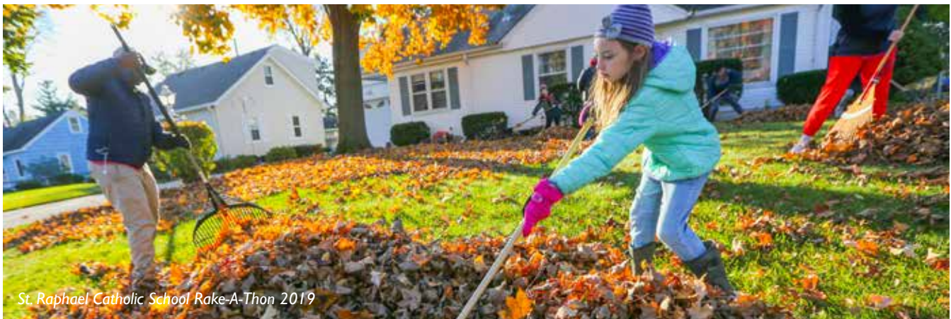
St. Raphael Catholic School Rake-A-Thon 2019

My dear brothers and sisters, let us then ascend to the Upper Room to learn how these lessons of faith, service, love and power will guide us in the fulfillment of our Synod dreams.