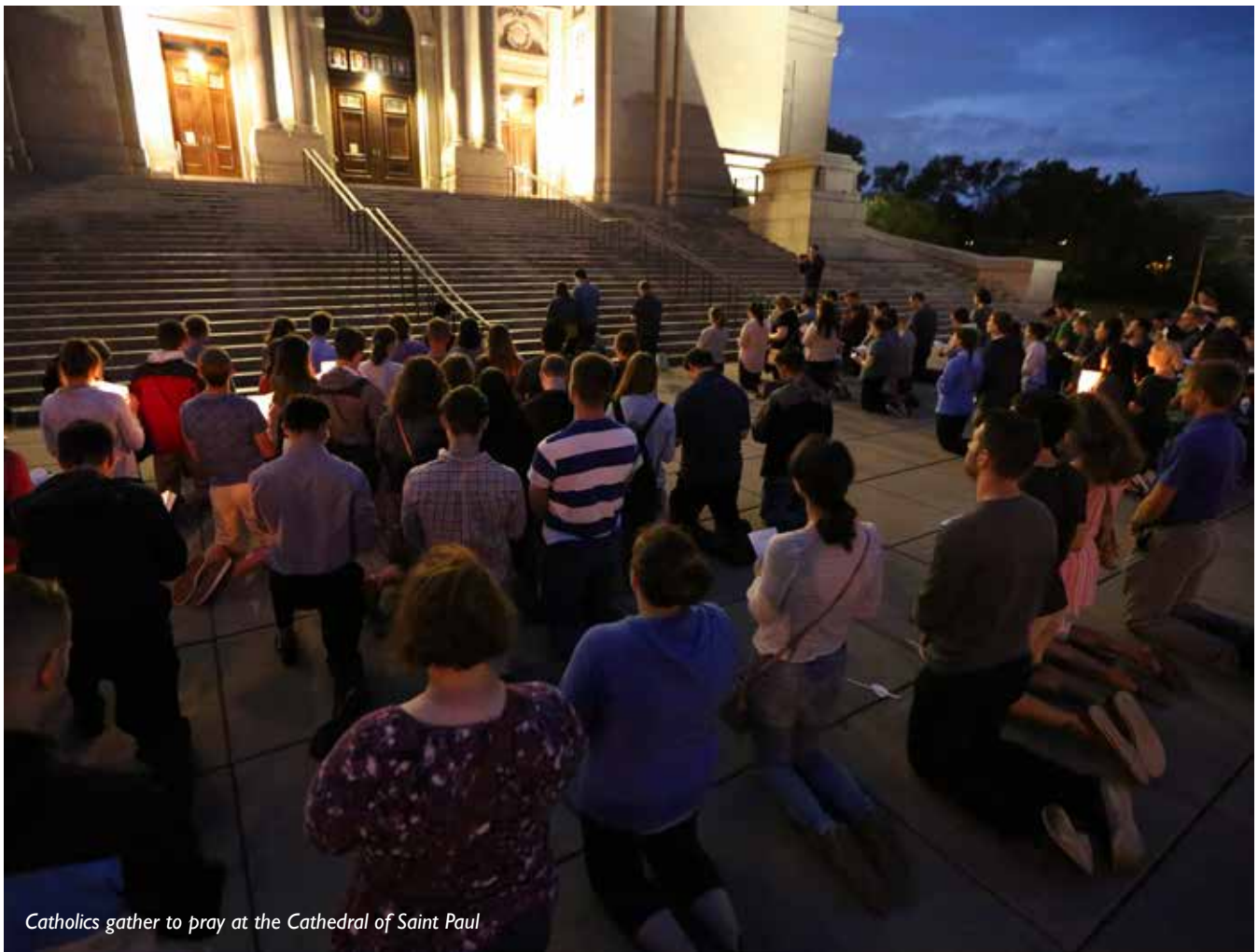
Catholics gather to pray at the Cathedral of Saint Paul

For those experiencing the deep burdens of having been abused or of having a loved one suffer abuse, and for those scandalized as a result of the failure of the Archdiocese to protect the vulnerable, I am sorry for the actions and inactions that caused so much pain and ask for your forgiveness. I pledge that our efforts to protect the young and vulnerable and to support those who have been wounded will continue, even as we now expand our focus to include other aspects of renewal.