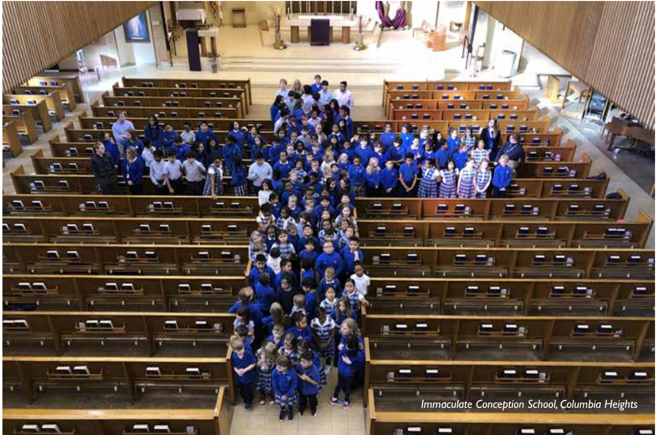
Immaculate Conception School, Columbia Heights

3. The work of the Office of the Chief Operating Officer to improve Archdiocesan Catholic Center effectiveness. The Archdiocese remains committed to the initiatives that are being undertaken to better support parishes and schools.