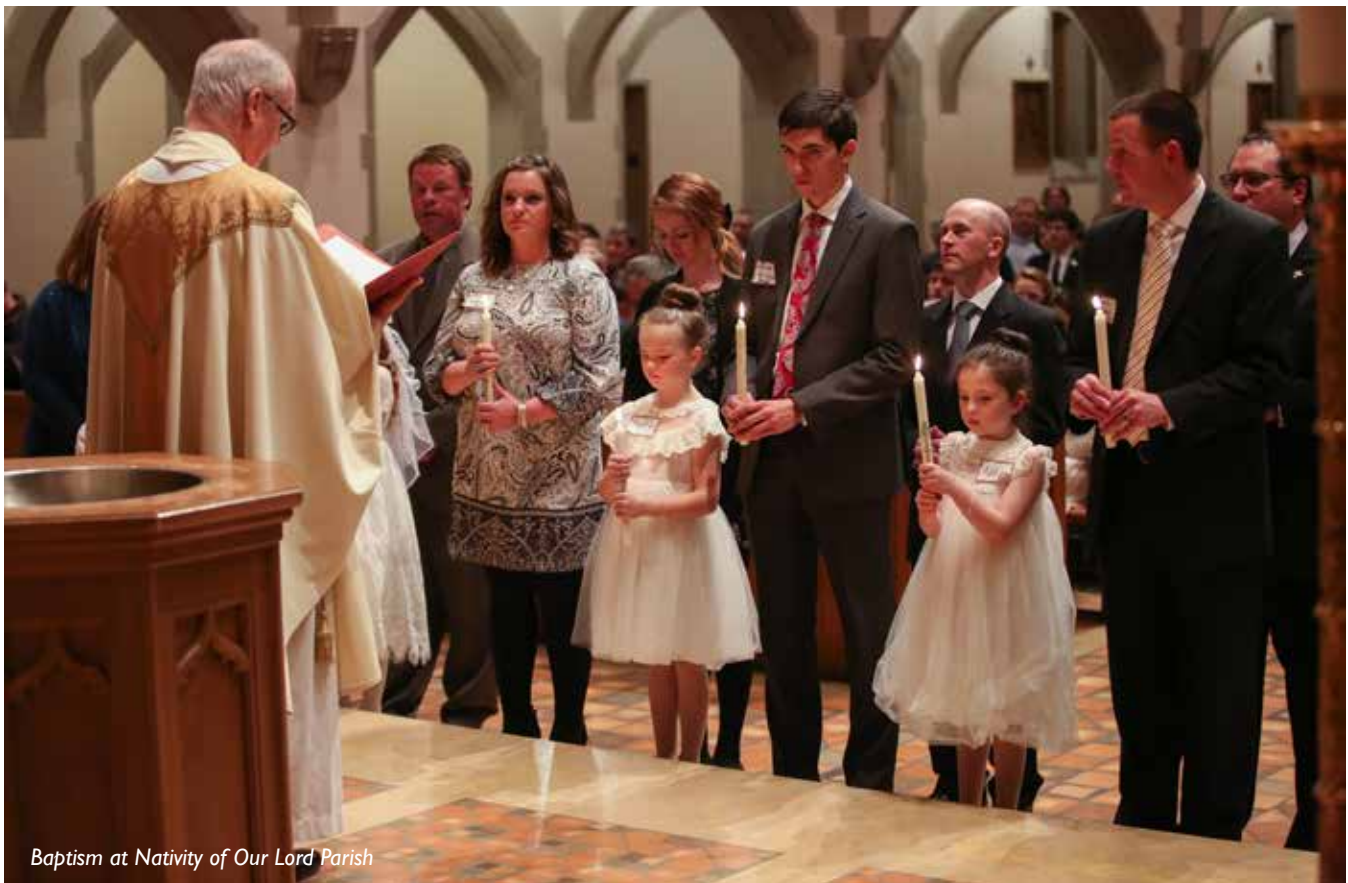
Baptism at Nativity of Our Lord Parish

Our encounter with the loving service of Jesus in the foot-washing leads us to the next mystery of the Upper Room: the Holy Eucharist.